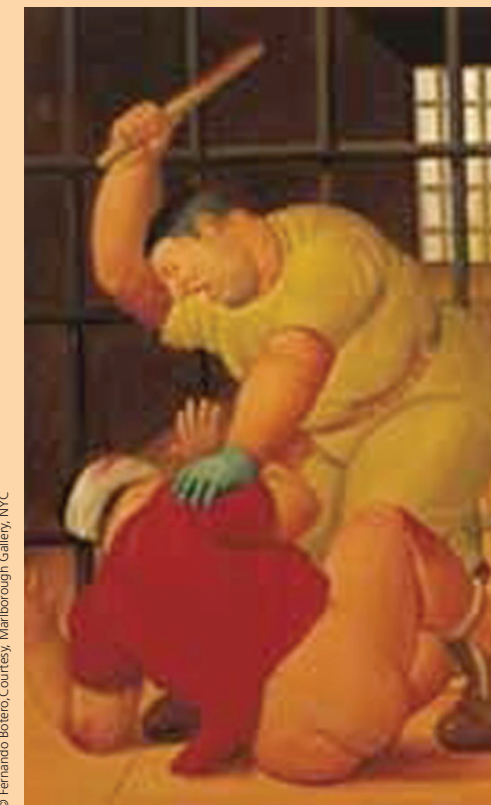
© Fernando Botero, Courtesy, Marlborough Gallery, NYC

“Promoting Our Common Humanity, At Home and Abroad”