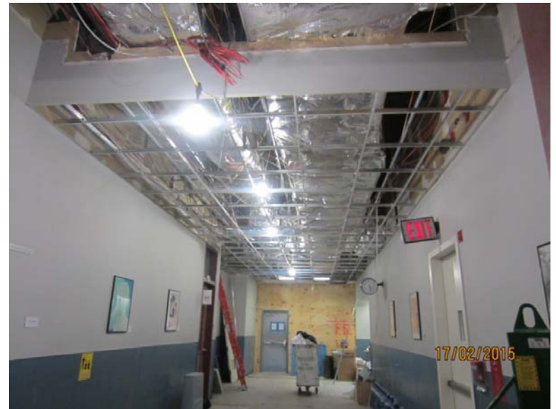
2 nd Fl- New Corridor Ceiling