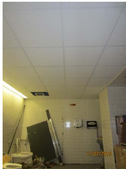
2 nd Fl- New Bathroom Ceiling