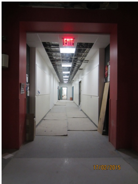
3 rd Fl- New Corridor Ceiling