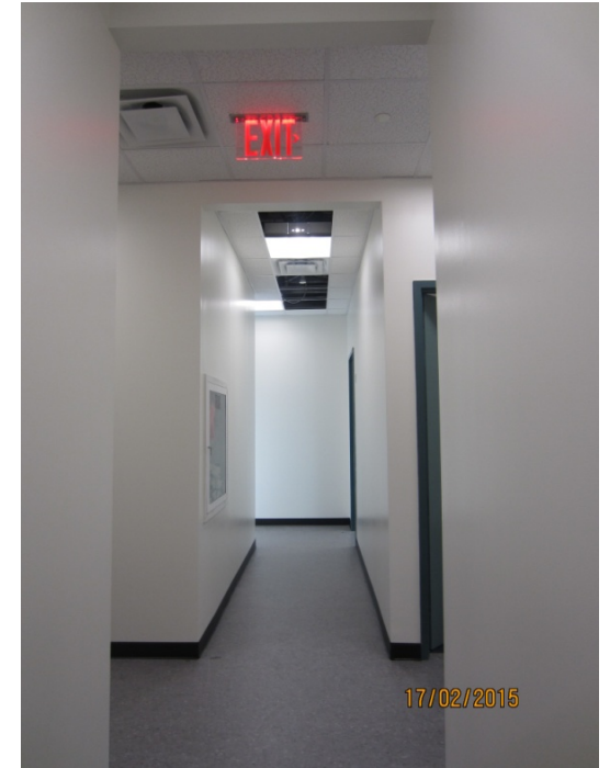
5 th Floor corridor- typical for installed finishes