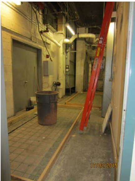
5 th Floor Mechanical after Demo