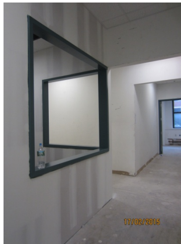
3 rd Fl offices