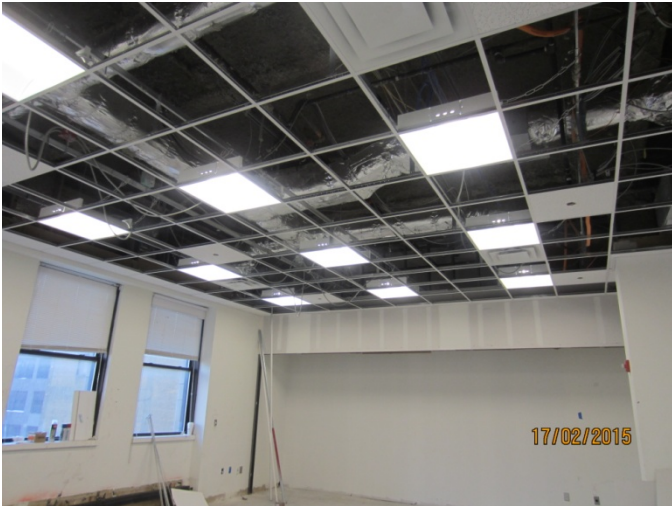
4 th Fl- New Ceiling and Storage area