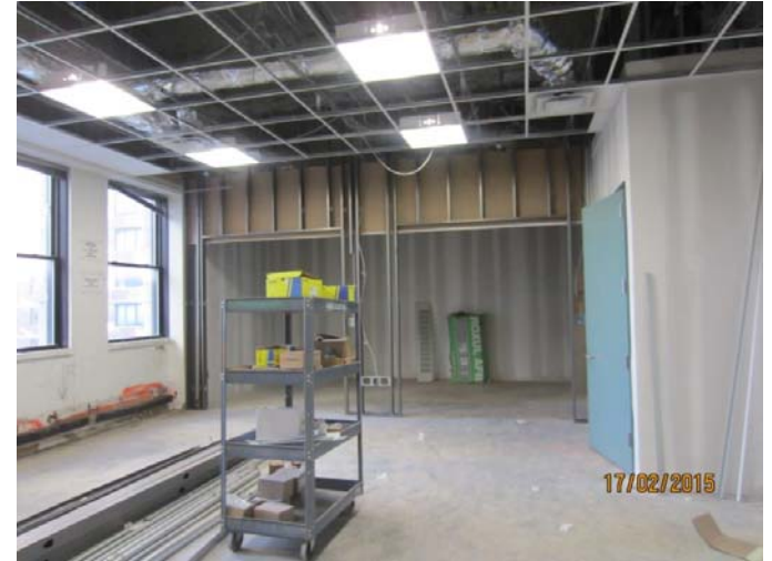
3 rd Fl Art Studio