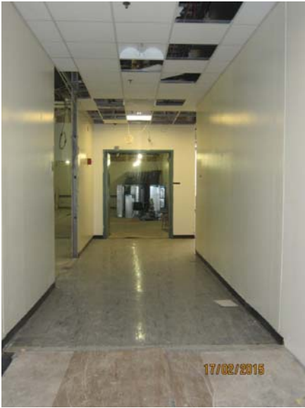
6 th Floor South after Demo