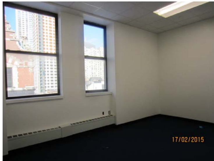
5 th Floor office- typical of installed finishes