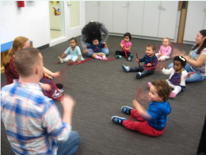
Music day for the little ones in the Children's Center