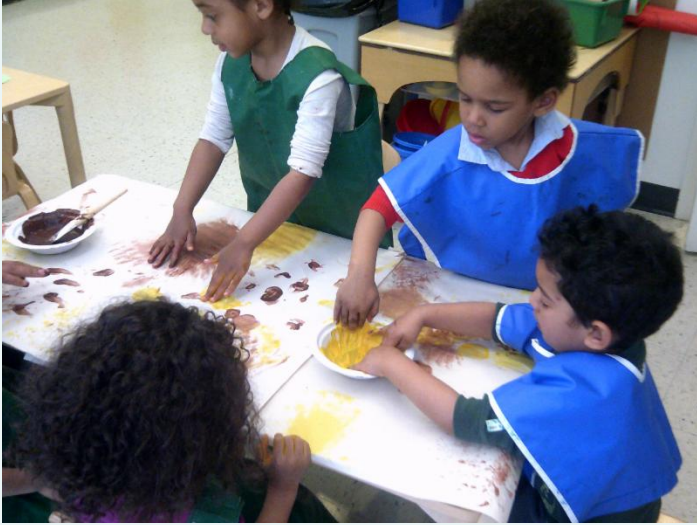
Our baby bloodhounds channel their inner Picasso in the Children's Center!