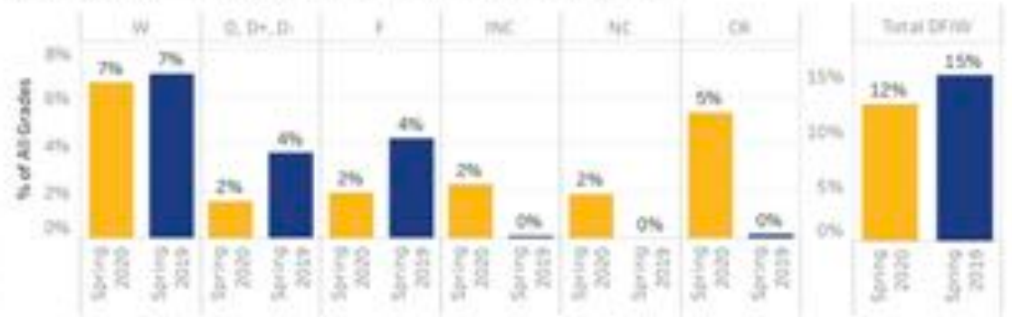
Course Grade Distribution (as of June 4 of both years)