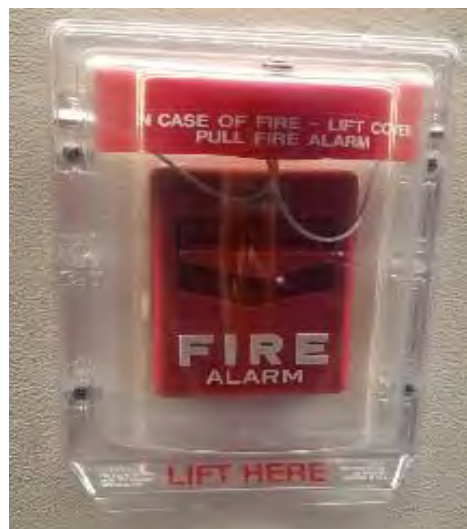
FIRE ALARM PULL STATION