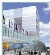
New Building 524 W 59th St