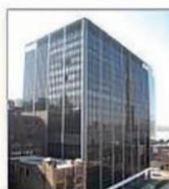
BMW 555 W 57th St, 6th Floor