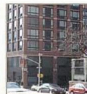
Westport 845 10th Ave, 1st & 2nd Floors