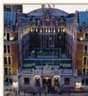
Haaren Hall 899 10th Ave