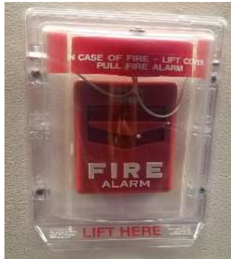
FIRE ALARM PULL STATION